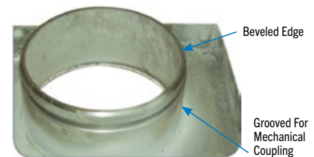
Figure 2. Beveled for Welding/Grooved Connection

Many of BAC's connections are both beveled for weld and grooved to suit a mechanical coupling. Either method of fastening to field-fabricated piping can be used when this connection type is provided (Figure 2).