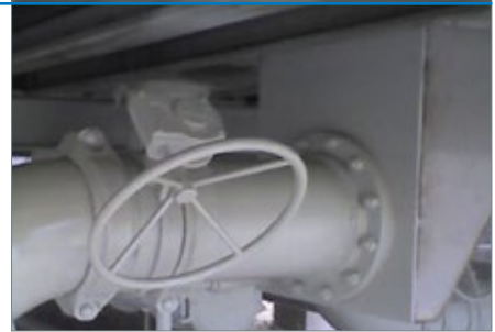
Figure 3. Side Outlet Depressed Sump Box

This option is offered to facilitate horizontal piping below the cold water basin of a unit, and is a compact alternative to using an elbow in the piping arrangement, saving installation time and cost ( Figure 3 ).