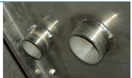
Figure 6. MPT Connection

This connection type is a threaded pipe stub connection designed to mate with a Female Pipe Thread (FPT) fitting ( Figure 6 ).