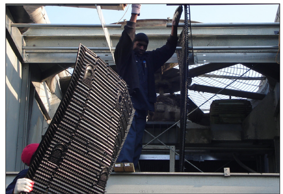
Start of Installation