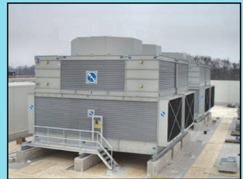
An Evaporative Condenser with Full Sound Attenuation