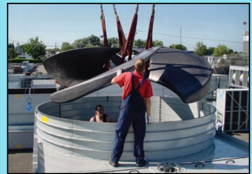
Whisper Quiet Fan Installation

Particularly sound-sensitive areas can be accommodated by facing the back panel to the sound-sensitive direction, reducing the propagation of sound.