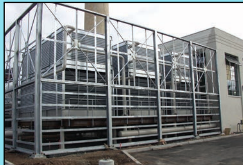
Barrier Walls Being Erected Around FXV Dual Air Intake Units