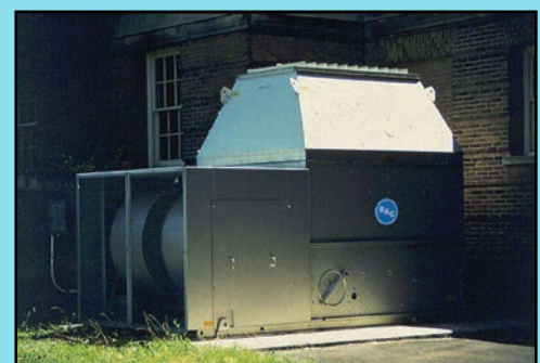
Series V Centrifugal Fan Single-Side Air Intake Unit with Full Sound Attenuation