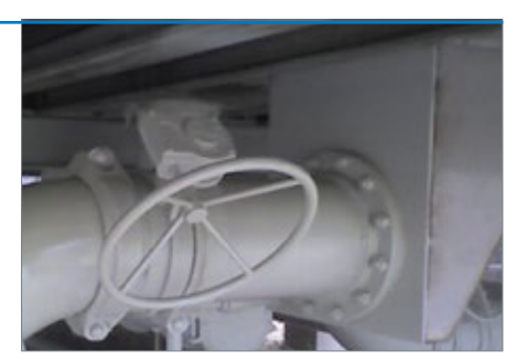
Figure 3. Side Outlet Depressed Sump Box

This option is offered to facilitate horizontal piping below the cold water basin of a unit, and is a compact alternative to using an elbow in the piping arrangement, saving installation time and cost ( Figure 3 ).