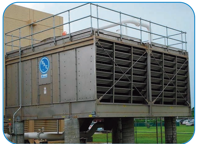
Series 3000 Cooling Tower

BAC's standard and upgraded Series 3000 and PT2 Cooling Tower products offer cost effective solutions for any code compliance need. Each installation requires careful analysis to specify the appropriate cooling tower. Please contact your local BAC Representative to discuss your project's specific requirements.